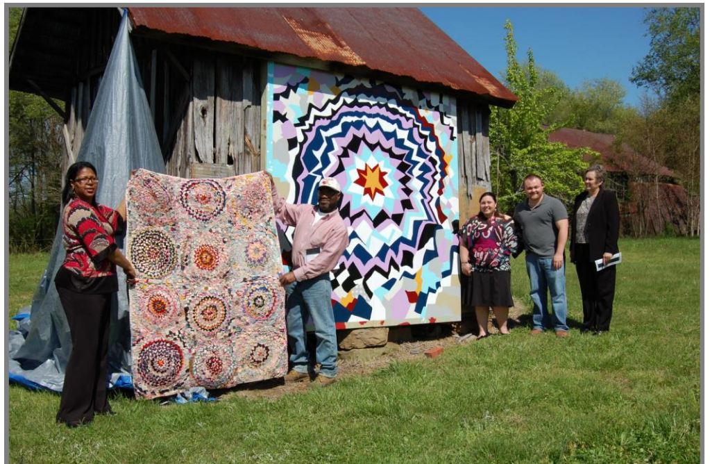
Painted quilt block replica hung on the old smokehouse; original quilt at left.